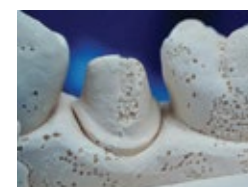
Porosity in stone due to immediate pour up